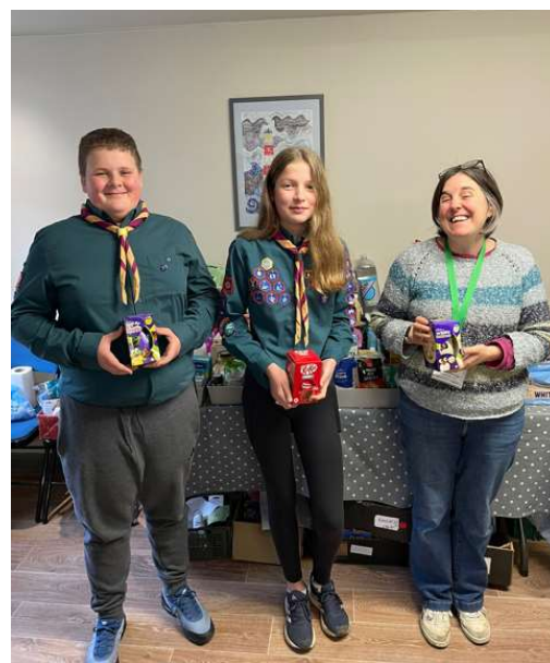
Surplus Easter Eggs being donated to the Food Bank for them to give out with food parcels for Easter.